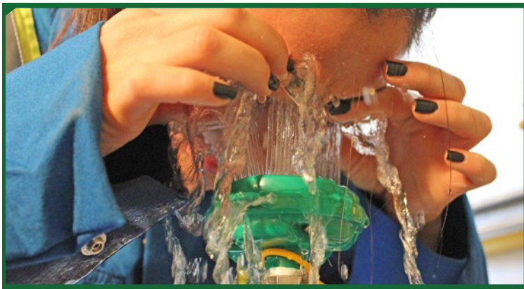
Easy access eyewash during operation.

The Polar Bear Safety Shower is the most cold resistant outdoor shower in North America. Safety and durability are the core concepts of this shower. It was designed from the ground up to function reliably every time.