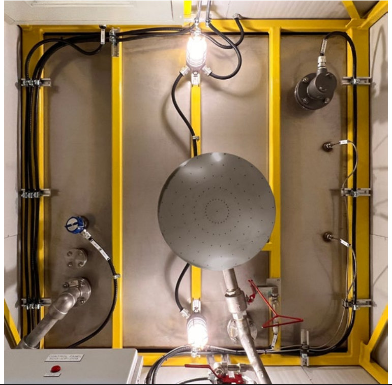
Standard General Purpose Model